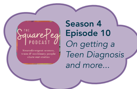
The SquarePeg Podcast